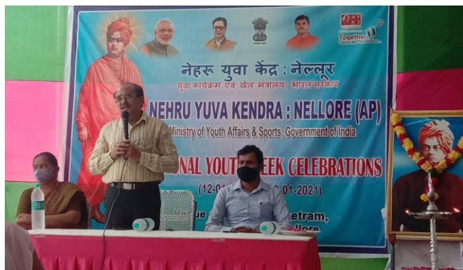
Principal of D.K.W College Addressing the Gathering