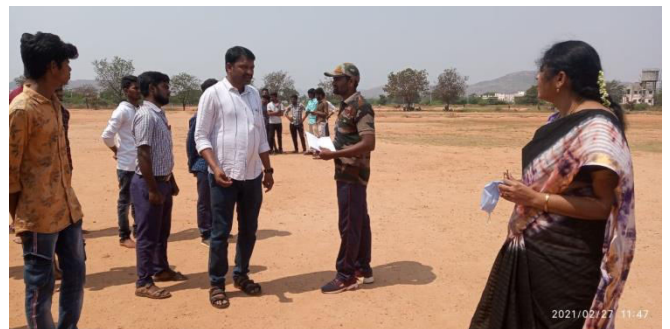
Army Selections camp in our college