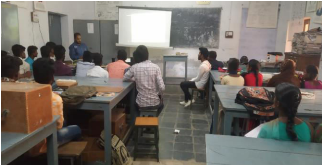
Bridge course by Department of Computer Science