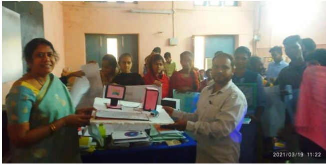
Student Study Projects