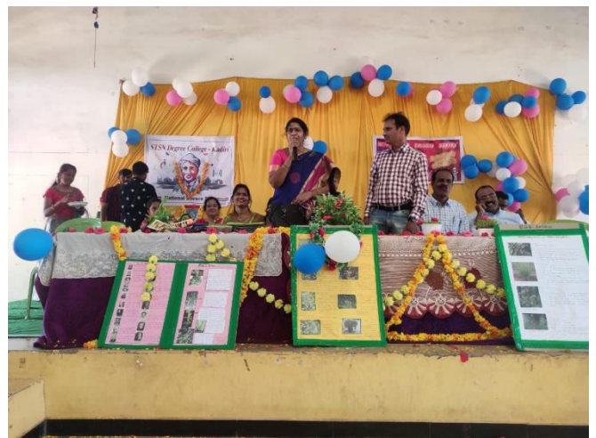
National Science Day