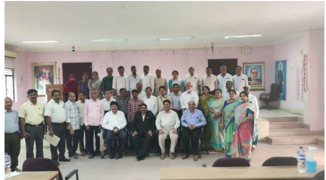
Valediction - Workshop on New Curriculum