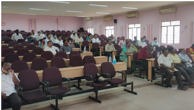
Workshop on New Curriculum @SKU