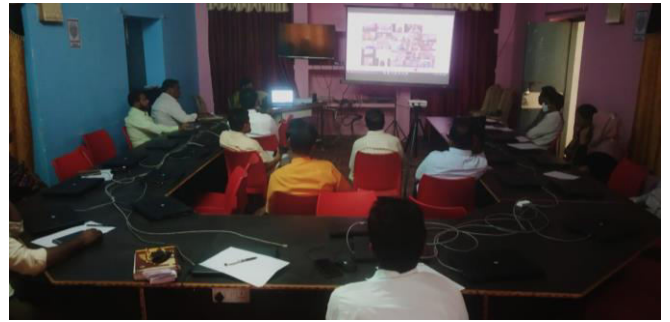
Workshop on Pedagogy Tools