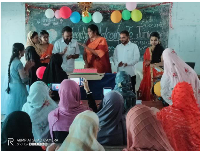
Socializing Event/Freshers Day